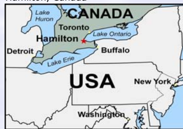
Figure 1. Location map of Hamilton, Canada