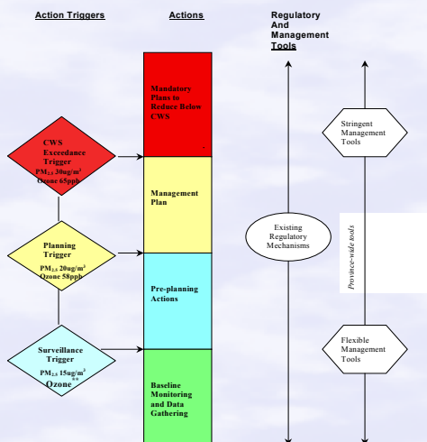
FIGURE 1: FINE PARTICULATE MATTER AND OZONE MANAGEMENT FRAMEWORK